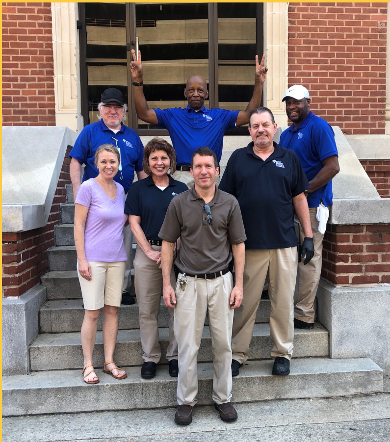
The crew from First Baptist Church of Columbia who helped move Hope Christian Academy to our new location.

In 2011 Hope moved to the campus of First Baptist Church of Columbia. The entire staff there welcomed us. In fact, in many ways they partnered with us. First Baptist staff helped whenever and wherever possible. Staff members taught our students classes like P.E. and Chorus; the office staff helped with copying and mailings; the maintenance staff kept our classrooms neat and helped whenever we asked. There were staff who drove buses for us on field trips, cooked meals and delivered them, used patience when we were noisy or messy, and helped us practice with life skills like manners. Most importantly, they all ministered to Hope's staff, students and their families. This summer when it was time for us to pack up and move to Grace Christian School their staff helped again. To say thank you is not adequate, but we thank God for the heart of the people at First Baptist Church! Your compassion has had a lasting impact on all of the families who came through your doors to be a part of Hope. We know God will continue to bless the people at First Baptist Church of Columbia, and that you will continue to bless others. Again, we offer our heartfelt thanks.